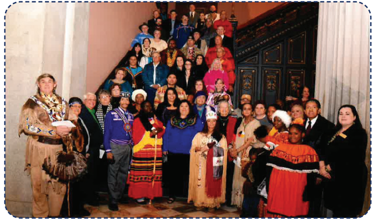
SC Native American Heritage Awareness Day Celebration "Building Our Nations" Tuesday, November 18, 2014, at the South Carolina State House. Sponsored by the SC Commission for Minority Affairs